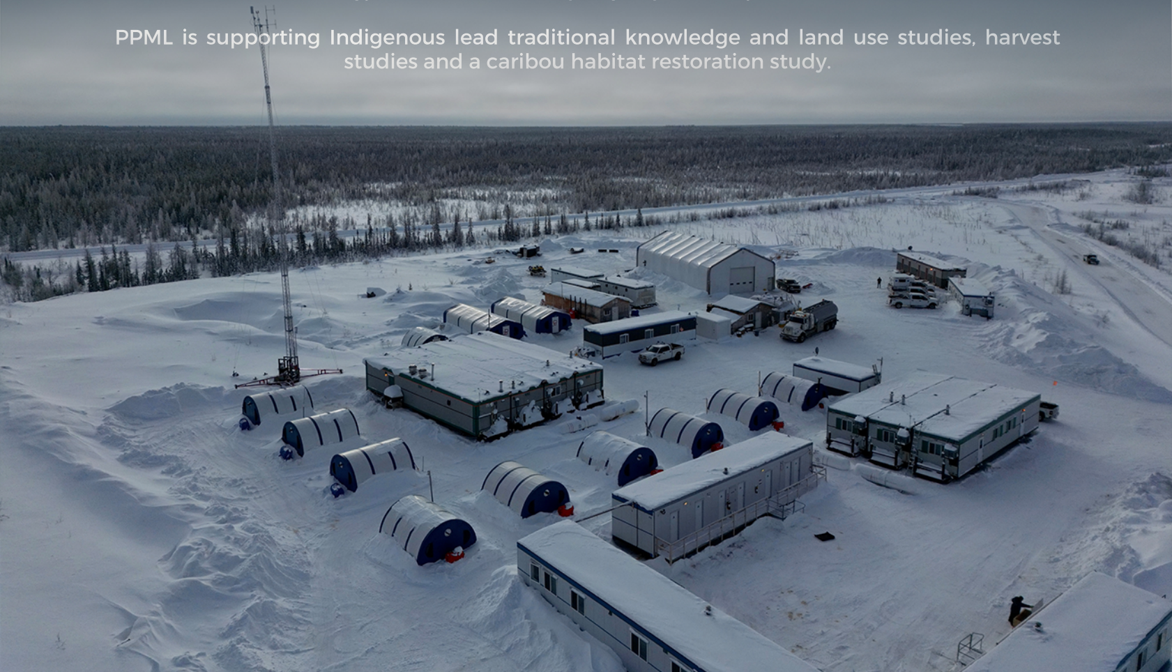
Drills turning at Pine Point

PPML is supporting Indigenous lead traditional knowledge and land use studies, harvest studies and a caribou habitat restoration study.